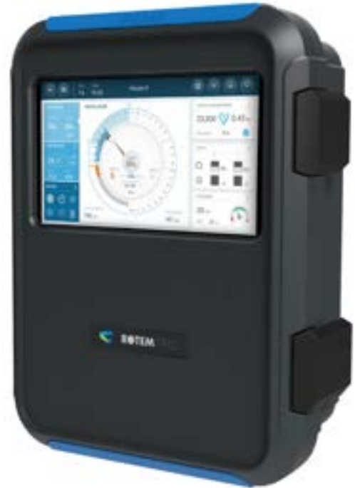
Munters Rotem Trio

IOT ready, Cloud Services, easy-to-use and real time TrioAir App, personal Munters ID account